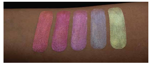
FROM LEFT TO RIGHT: KTZ® BOLERO CROMATICO, KTZ® FOLIAGE FLUTTER, KTZ® JAIPUR SUNSET, KTZ® WINTERVELD, KTZ® XIAN VISTAS