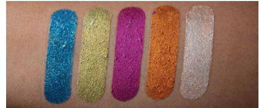
FROM LEFT TO RIGHT: K-RAY® G TAHITI SPARKLE, KTZ® MOSS, K-RAY® SM FINE FUCHSIA, K-RAY® SM SAFFRON YellowGold & K-RAY® SM METALLIC BLOOM