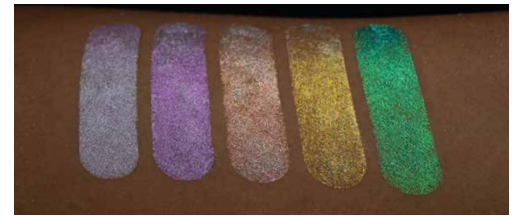
FROM LEFT TO RIGHT: KTZ® SM HOLOGRAPHIC VIVID Pink, KTZ® KTZ SIL PRISMATIC BlueRed, KTZ® SIL HOLOGRAPHIC RedGreen, KTZ® SIL HOLOGRAPHIC OrangeGreen, & KTZ® SIL HOLOGRAPHIC BRIGHT VioletBlue