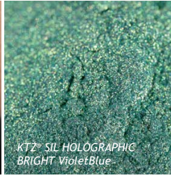
KTZ® SIL HOLOGRAPHIC BRIGHT VioletBlue

Pigments using a multilayer technology to achieve bright and intense color and extremely long color travel.