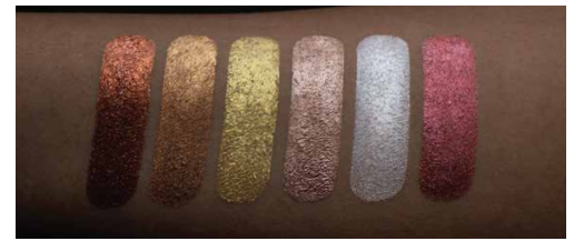
FROM LEFT TO RIGHT: KTZ® COPPER SHIMMER, KTZ® SM BRASSY BRONZE, KTZ® SUNBURST GOLD, KTZ® ARUBAN CORAL, K-RAY® SM NUDE, & KTZ® ROUSSILLON SHIMMER